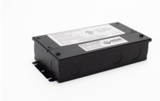
TLD24V-60W 60W Class 2 LED driver 100-277V input, 24V output TRIAC, ELV, MLV, Forward & reverse phase, PWM output 1/2" knockout size Wet locations rated Dimensions: 7.4" x 3.7" x 1.6" (188mm x 94.5mm x 40mm)