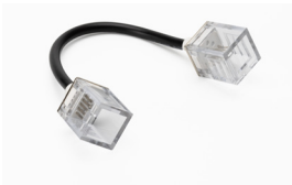
TL-JOIN6-1515 Tape to tape with 6inch wire lead for RGBW Neonflex (15mm)