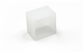
TL-EC24V-1515 End cap for RGBW Neonflex (15mm)