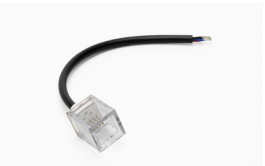
TL-WL6-1515 Tape to wire with 6inch lead for RGBW Neonflex (15mm)