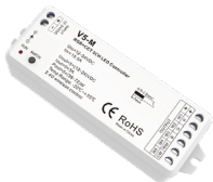
TL-WIFI-CTLR WIFI & RF controller for RGBW and RGB-CCT tape light, 12-24VDC 3A x 5 channels (15A Max)