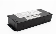
TLD24V-96W 96W Class 2 LED driver 100-277V input, 24V output TRIAC, ELV, MLV, Forward & reverse phase, PWM output 1/2" knockout size Wet locations rated Dimensions: 8.7" x 3.7" x 1.6" (220mm x 94.5mm x 40mm)