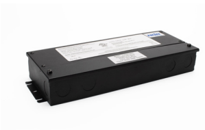
TLD24V-288W 288W Class 2 LED driver 100-277V input, 24V output x3 (3x 96W output) TRIAC, ELV, MLV, Forward & reverse phase, PWM output 1/2" knockout size Wet locations rated Dimensions: 11.9" x 4.3" x 1.8" (301mm x 110mm x 45mm)