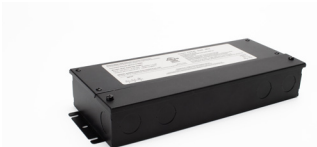
TLD24V-192W 192W Class 2 LED driver 100-277V input, 24V output x2 (2x 96W output) TRIAC, ELV, MLV, Forward & reverse phase, PWM output 1/2" knockout size Wet locations rated Dimensions: 10.9" x 4.3" x 1.8" (278mm x 110mm x 40mm)