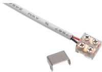
TL-STW8-2-10 2-Pin screw connector, tape to 8" wire lead (8-10mm)