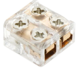
TL-STB-2-10 2-Pin screw connector terminal block (8-10mm)