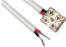
TL-EXT6FT-2-10 2-Pin Screw Connector - 6 Foot Extension (8-10mm)