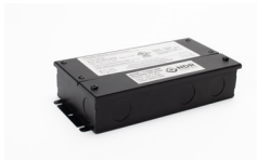
TLD24V-60W 60W Class 2 LED driver 100-277V input, 24V output TRIAC, ELV, MLV, Forward & reverse phase, PWM output 1/2" knockout size Wet locations rated Dimensions: 7.4" x 3.7" x 1.6" (188mm x 94.5mm x 40mm)