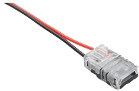
TL-CTW6-2-10 2-Pin tape to 6" wire lead connector (10mm)