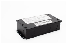
TLD24V-30W 30W Class 2 LED driver 100-277V input, 24V output TRIAC, ELV, MLV, Forward & reverse phase, PWM output 1/2" knockout size Wet locations rated Dimensions: 6.5" x 3.7" x 1.6" (165mm x 94.5mm x 40mm)